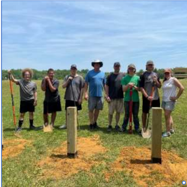
The Church of Latter-Day Saints completed several service projects including rebuilding new horse water